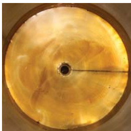
LEADING COMPETITOR 750 HOURS