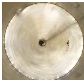
MOBIL DTE 10 EXCEL 2,500 HOURS

In demanding proprietary MHFD testing, Mobil DTE 10 Excel outlasts competitive mineral products, keeping systems cleaner for longer periods of time.